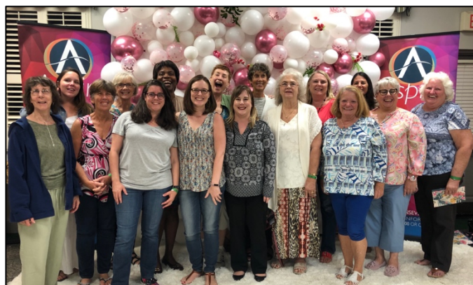
GraceSpring was well represented at the recent Aspire Women’s Conference at Pathway Church.